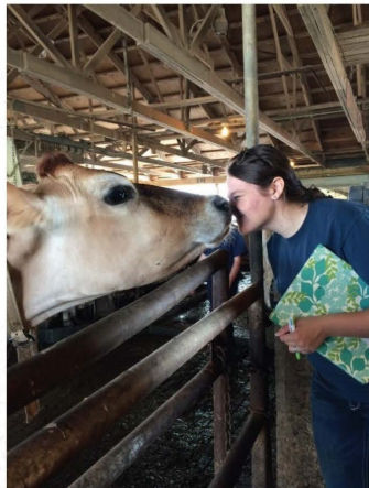
WELFARE AND BEHAVIOR